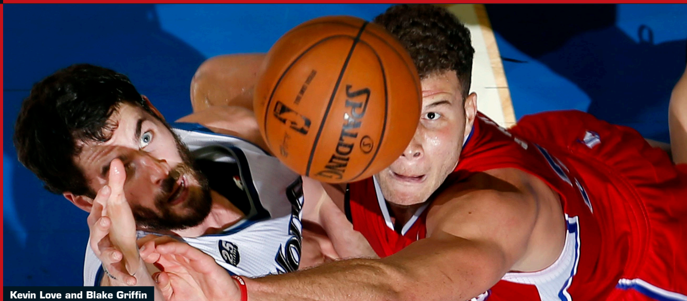
Kevin Love and Blake Griffin