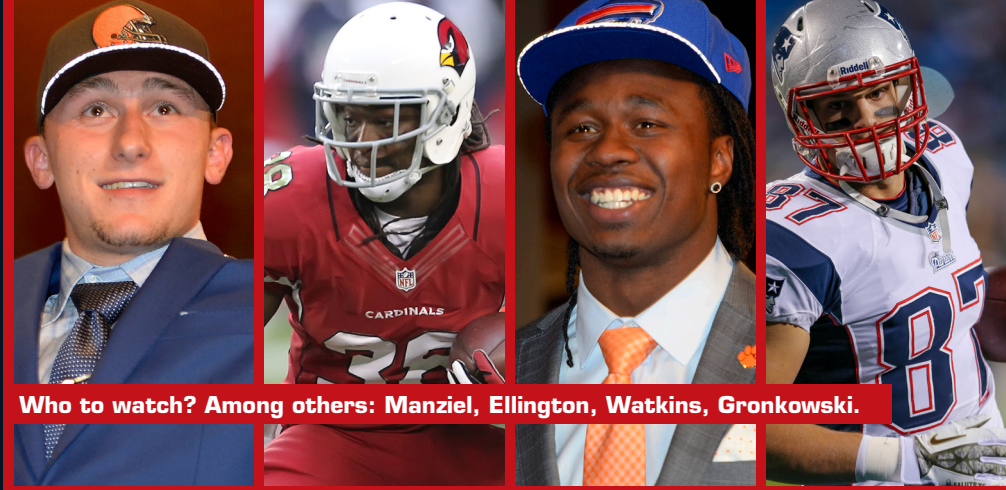
Who to watch? Among others: Manziel, Ellington, Watkins, Gronkowski.